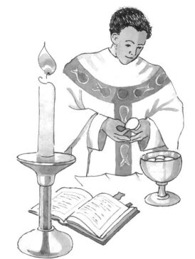
Consecration — Body — Blood

of the Liturgy of the E ____ . The priest says the Eucharistic Prayer. The bread and wine are changed