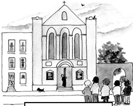
Mass — Church

Use the words shown below each of the pictures to fill in the blanks in this passage.