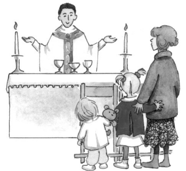
Offertory — Eucharist

p ____ talks to us about the message in the readings. The priest also prepares the gifts brought to the altar at the O _____ ____ . We also think about offering ourselves